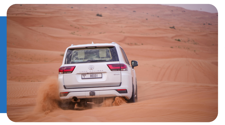
Day 3: DUBAI - SAFARI

Breakfast at the hotel. Free morning. In the afternoon, our most popular excursion: Desert Safari. Land Cruisers (6 people per vehicle) will pick you up between 3:00 - 3:30 PM for an exciting drive over the magnificent high dunes.